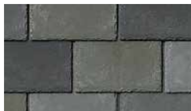
Wintergreen (CR-792) Mix

Actual colors may vary from printed representation.