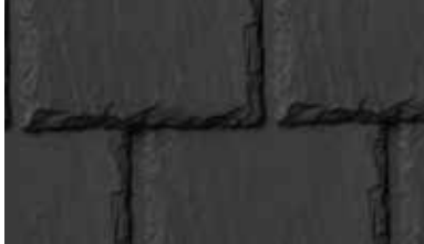
Charcoal Black (801)

No matter your home's shade and style, an Inspire color can provide a perfect complement.