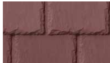
Red Rock (809)