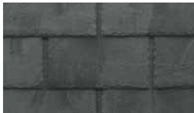
Grey/Black Blend (718) Not available in Aledora Slate