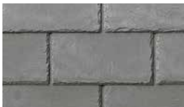
Ash Grey (CR-731)