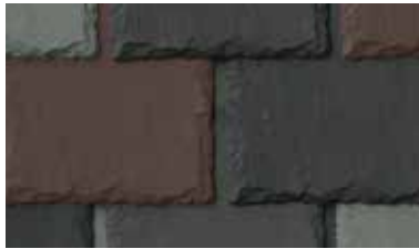
Nottingham (788) Charcoal Black (801), Steel Grey (804) Brandywine (806), Olive (814)