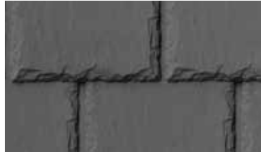
Mist Grey (803)