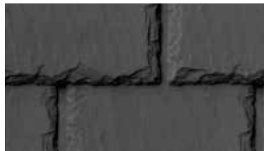
Steel Grey (804)