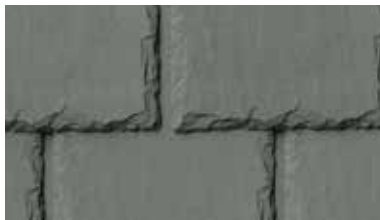
Sage Green (815)