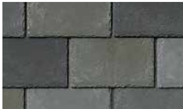
Wintergreen (792) Cool Roof Mix Evergreen (730), Ash Grey (731), Granite (732), Graphite (733)