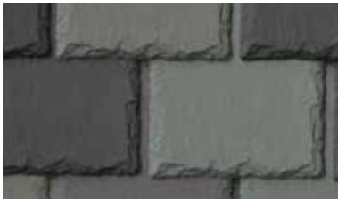
Brunswick (791) Mist Grey (803), Steel Grey (804) Olive (814), Sage Green (815)

From our alluring mixes of Coachman, Nottingham, and Concord, to our magnificent Brunswick mix, we offer both subtle and striking color variations that enhance the architectural appeal and integrity of your home. With Inspire mixes, there is never any need to shuffle tiles from multiple bundles prior to installation. Each bundle comes factory-sorted and ready for application. Choose from our standard pre-mixes below or create a breathtaking custom mix of your own.