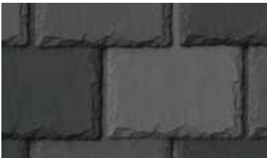
Coachman (790) Charcoal Black (801), Mist Grey (803), Steel Grey (804)