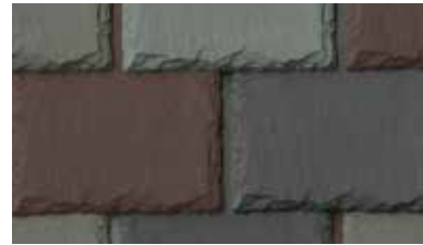
Concord (789) Steel Grey (804), Brandywine (806), Olive (814), Sage Green (815)